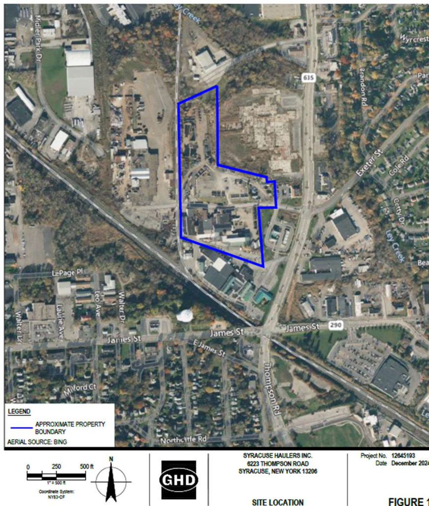
Figure 2. Site Plan

Syracuse Haulers provides solid waste, recyclables and construction & demolition debris collection services for municipal, institutional and commercial customers in Central New York. The facility is used to provide consolidation and transfer of loads of source-separated recyclables, non-putrescible commercial solid wastes, non-putrescible bulk wastes and C&D debris. Syracuse Haulers is proposing to expand facility operations within the existing lot with the use of a new pre-fabricated steel building on the lot and a recycling sorter. The project will allow the facility to accept more material that can be recovered and recycled in lieu of being landfilled.